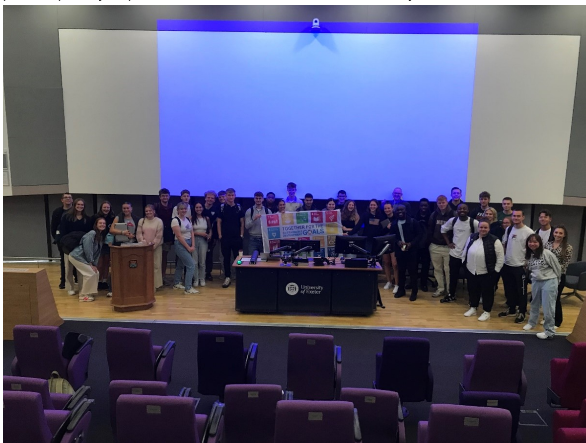
Students from BEM3033 showing their support for Global Impact's Fly the Flag Day (2023).

The School is continuously looking to refresh the content of our modules to reflect our purpose and values. For example, in 2023-24 we introduced a sustainability-based digital simulation exercise using Cengage's HUBRO educational platform on BEM3033 Strategic Management, the 30-credit capstone module for our BSc Business and Management programme. The new simulation foregrounds the United Nations Sustainable Development Goals (UN-SDGs) and places a primary emphasis on business ethics and environmental justice.